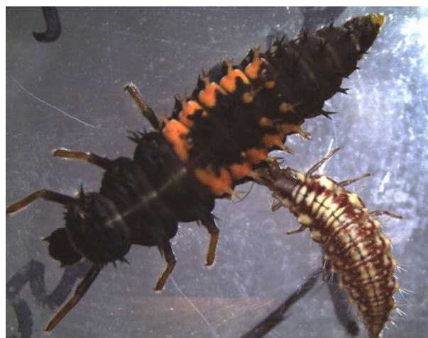
Figure 1. Third instar C. carnea larva biting into soft abdominal segments of its intraguild prey, fourth instar H. axyridis larva.

The native lacewing C. carnea was the superior intraguild predator in trials against the invasive ladybird H. axyridis ; two hoverfly species, E. balteatus and E. eligans defended themselves against IGP. Until now, there was only one member of the aphidophagous guild known to effectively kill H. axyridis , the eyed ladybird A. ocellata , which is larger than H. axyridis . C. carnea is the first aphidophagous insect that appeared superior to H. axyridis in IGP encounters despite its smaller size.