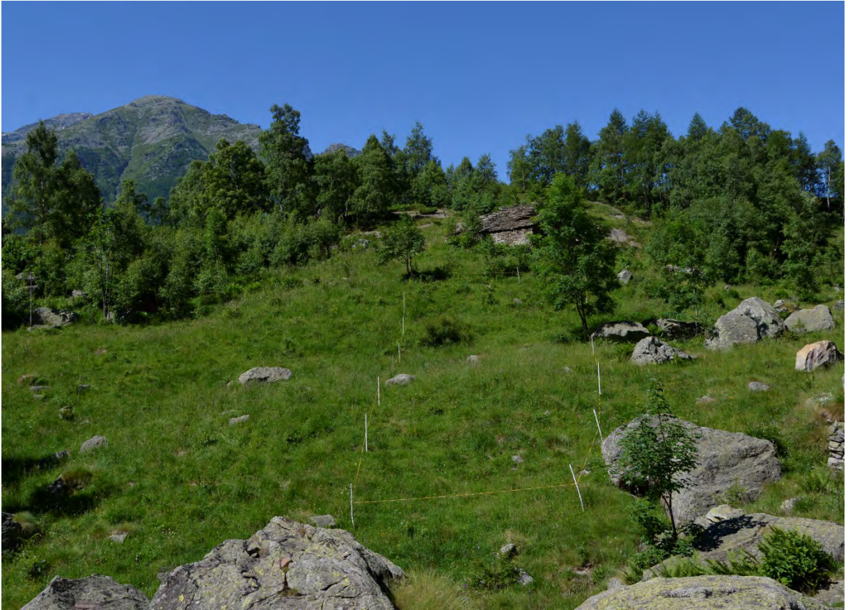
Figure 2: Noaschetta Valley, GPNP: Grazing exclusion plot.