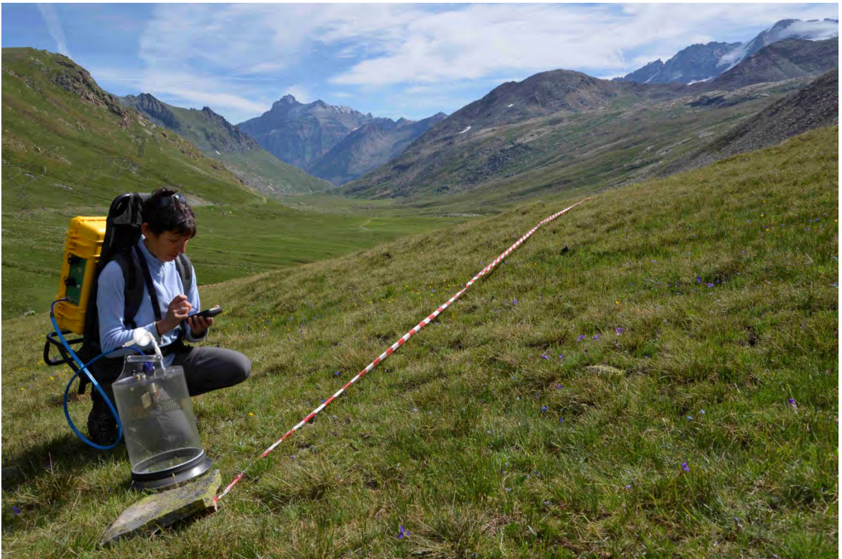
Figure 3: Nivolet plain, GPNP: Flux chamber in use.